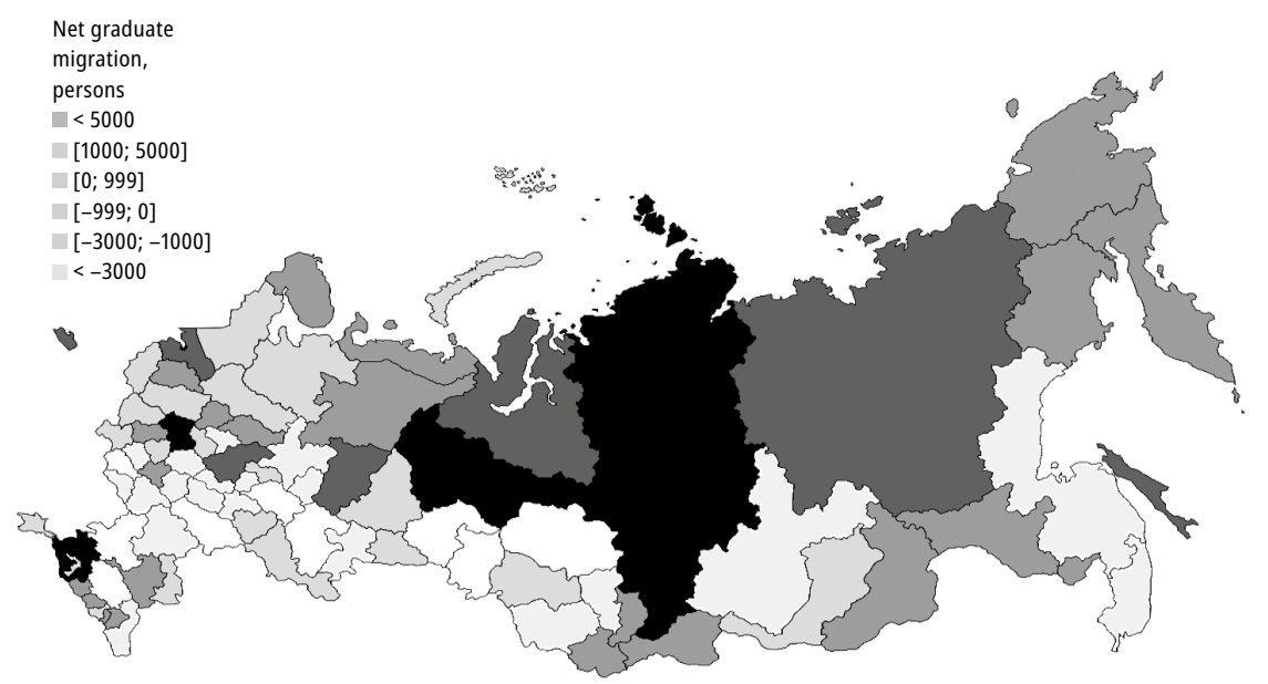
Figure 2. Migration attractiveness of Russia's regions to university graduates, calculated on the basis of 2013–2015 net migration rates.