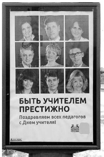
Figure 2. "It is prestigious to be a teacher."

In the focus groups, some students felt that it was a good idea for the government to use such “propaganda” to improve teachers’ status, but most perceived this billboard as yet another “declaration” and “empty words.” For example, one group of students shared their feelings about how “unnatural” and “fake” the billboard message felt. When I asked, what their reaction towards the billboard was, Vika answered first: